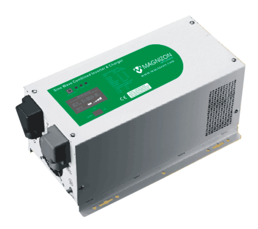
Fig. 3 – Overview (4)