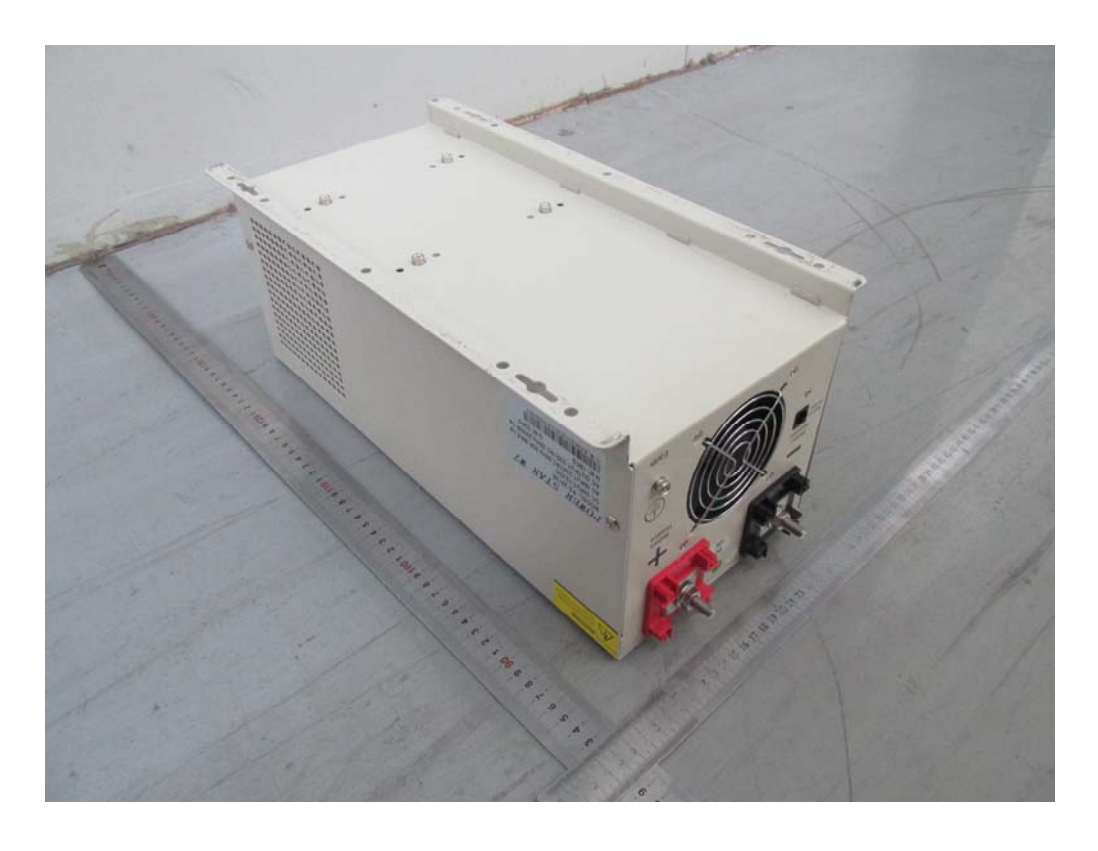
Fig. 2 – Overview (2)