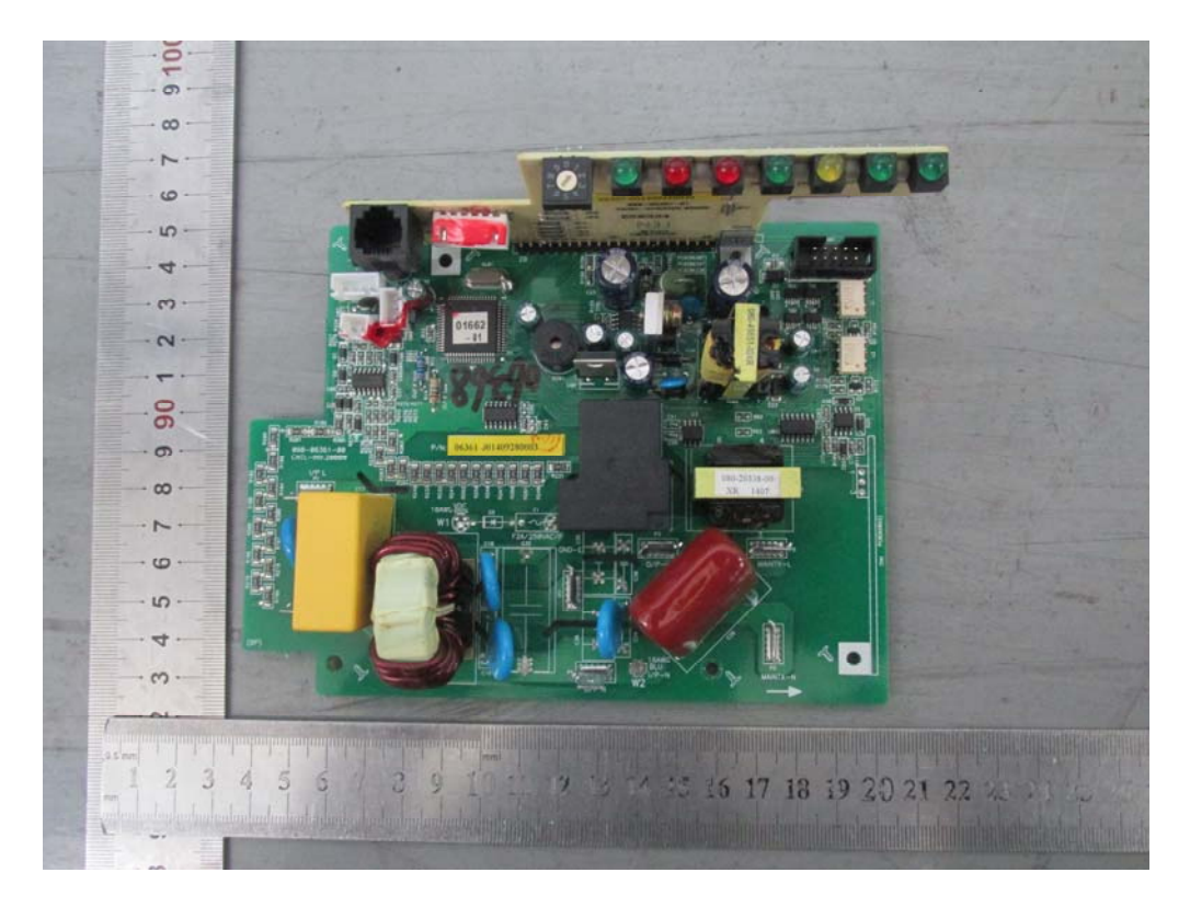
Fig. 6 –Power board view