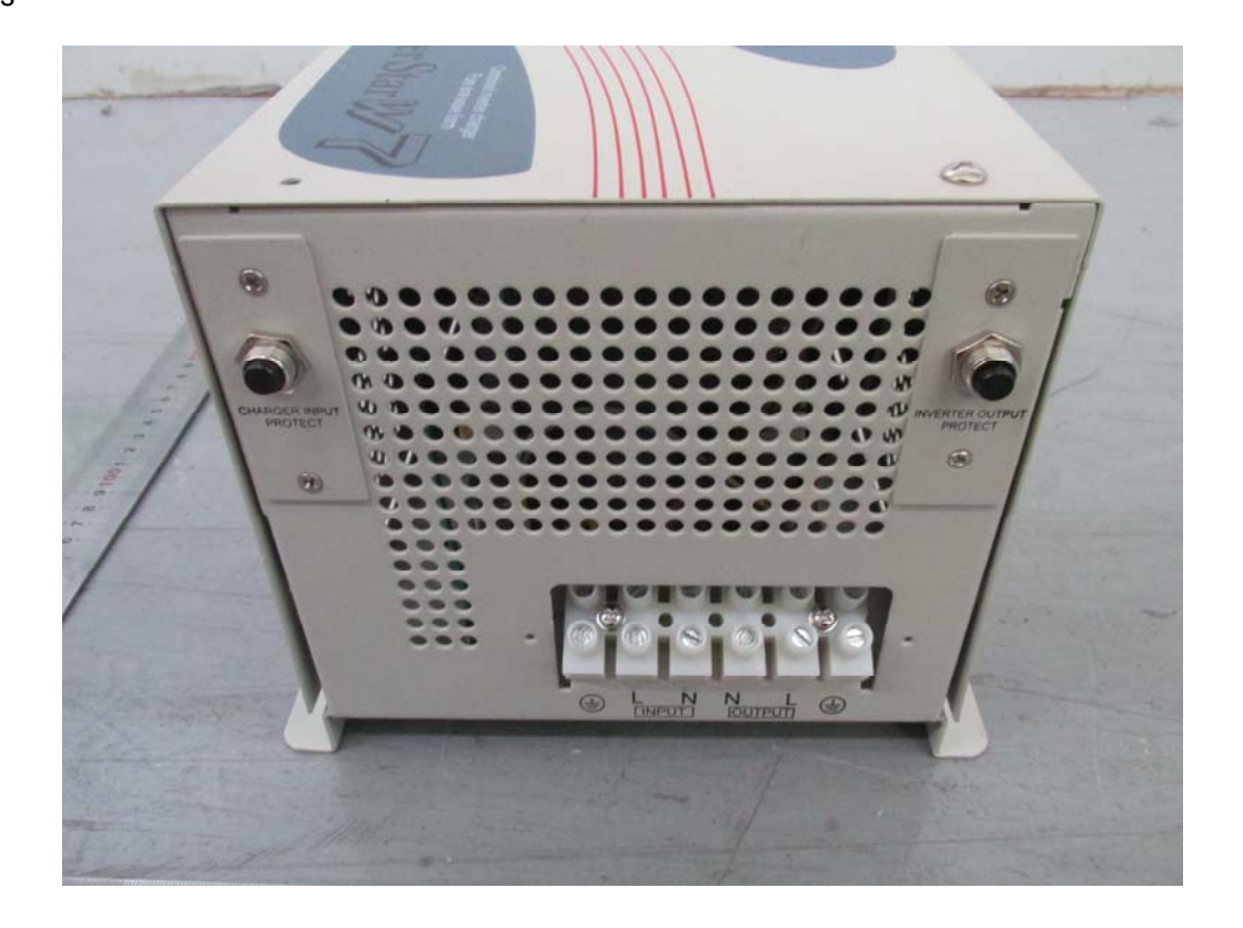
Fig. 3 – Overview (3)