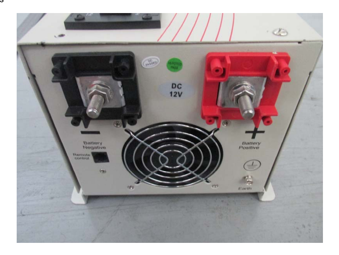
Fig. 4 – Overview (5)