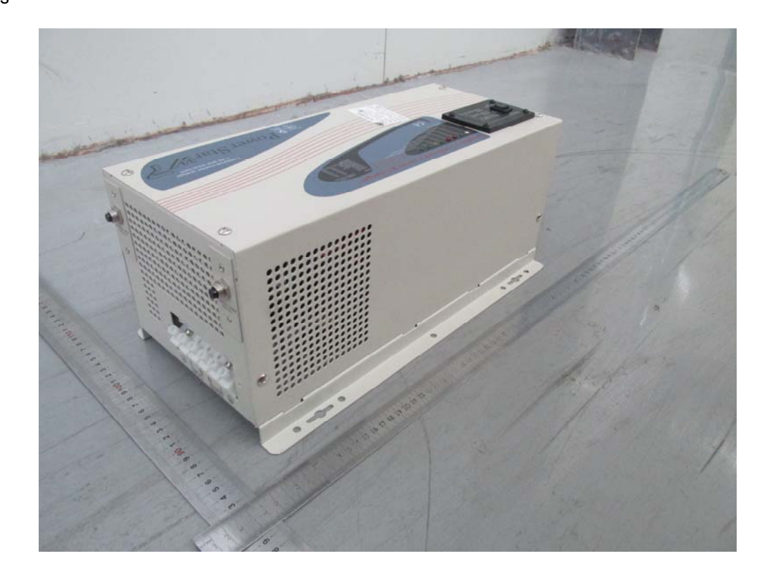
Fig. 1 – Overview (1)